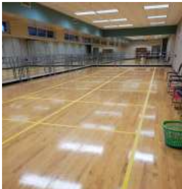
Dance Studio Movement Activities Campers will be spaced 6' apart in marked boxes.